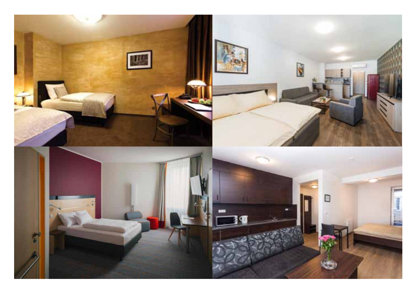
Category 2: Double room: 70 EUR / person, Single room: 80 EUR / night

Category 1: Double room: 80 EUR / person, Single room: 95 EUR / night