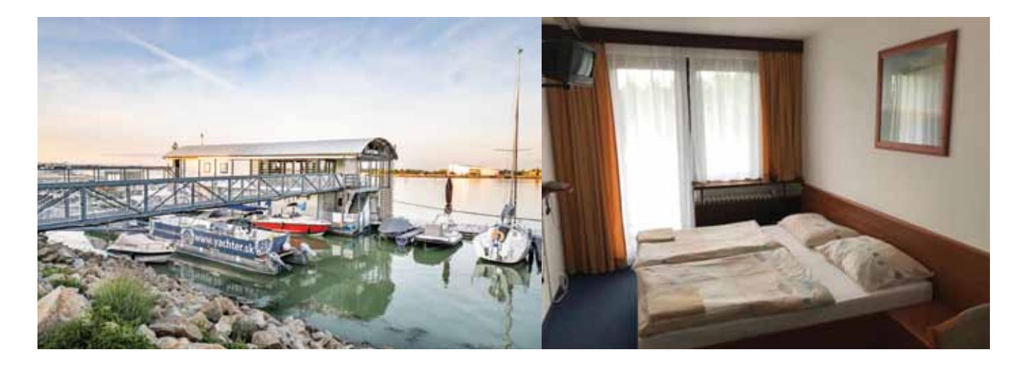
Category 4: Multiple room: 40 EUR / person, Single room: 70 EUR / night

Category 3: Person: 55 EUR / night, Single room: 70 EUR