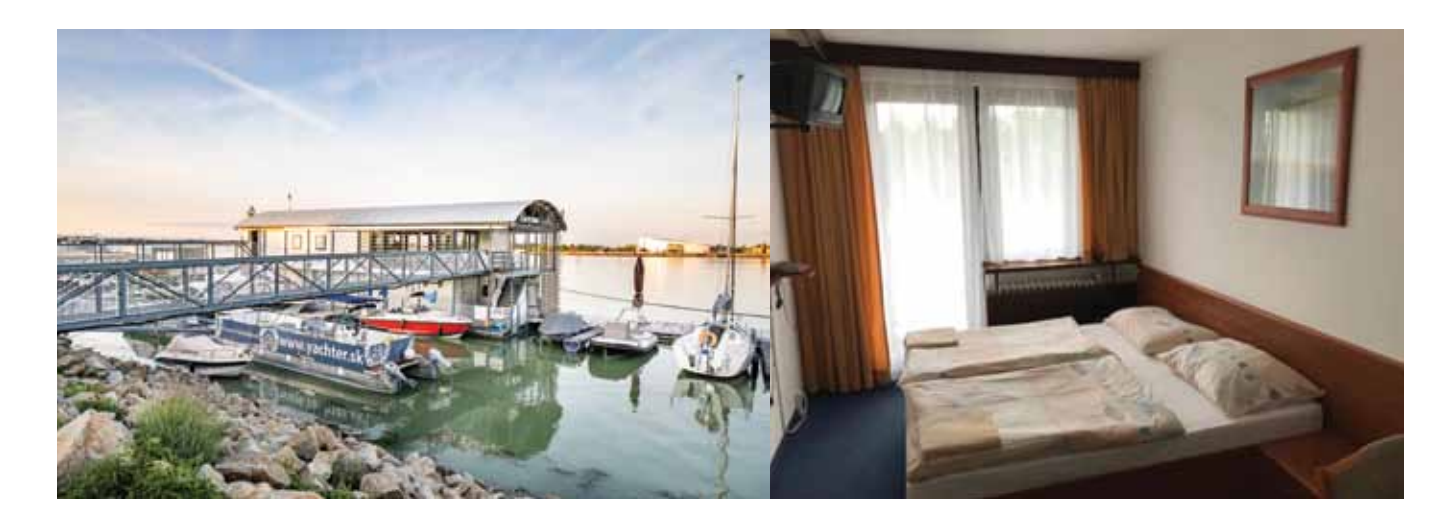
Category 4: Multiple room: 50 EUR / person, Single room: 70 EUR / night